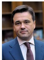
Andrey Vorobiev Governor Moscow region