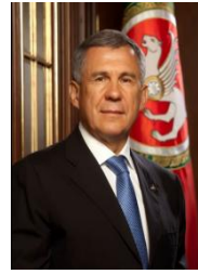
Rustam Minnikhanov President The Republic of Tatarstan