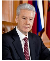
Sergey Sobianin The mayor of Moscow