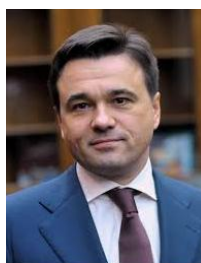
Andrey Vorobiev Governor Moscow region