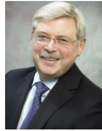
Sergey Zhvachkin Governor Tomsk region